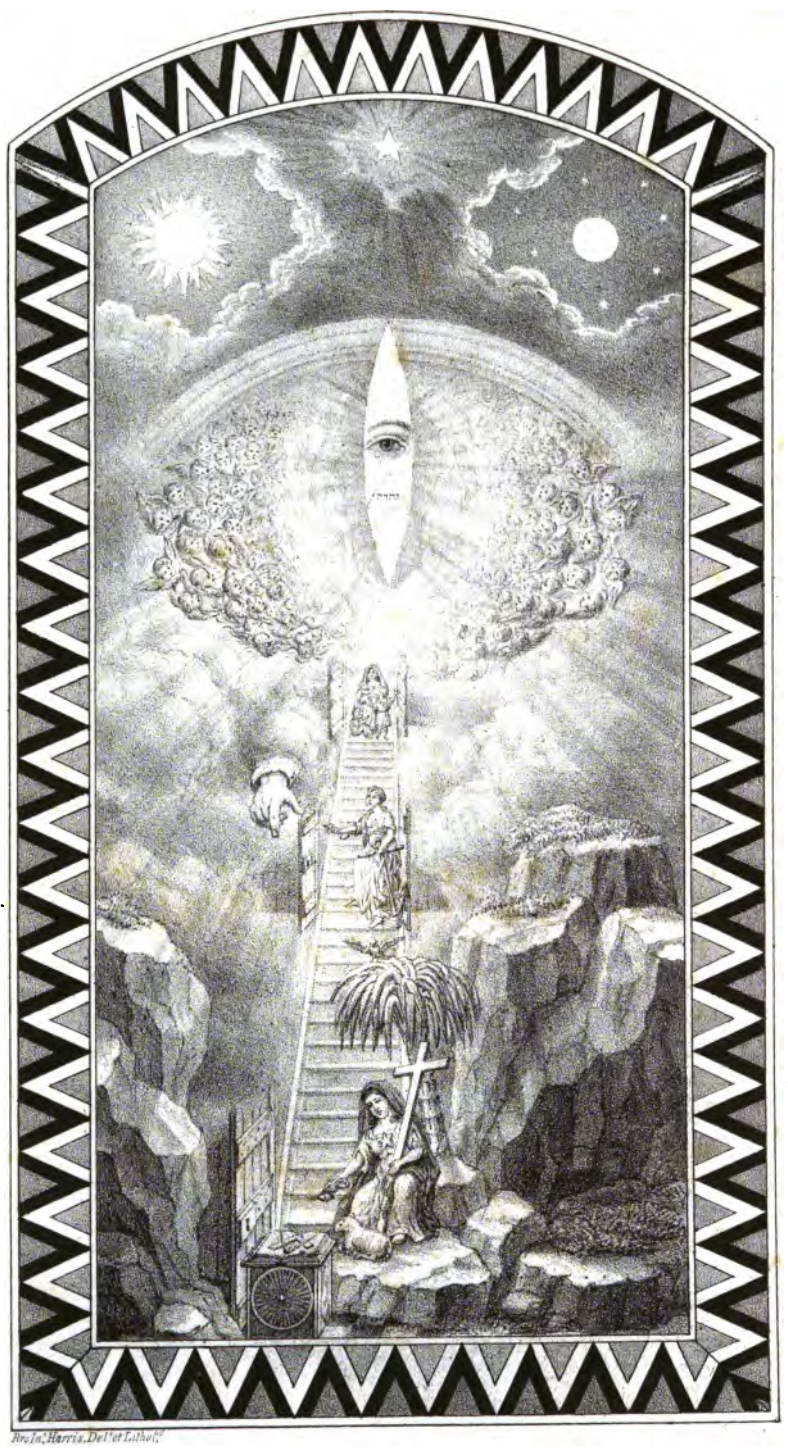
SIC ITUR AD ASTRA.